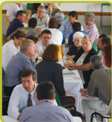
Deputations were received in Sarina on the Monday morning of the Community Cabinet.